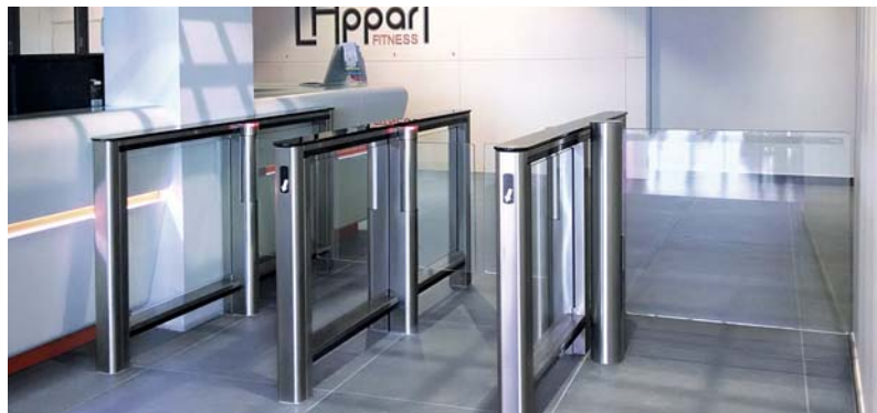
Speed gates ST-01, Fitness club L'Appart Fitness, France