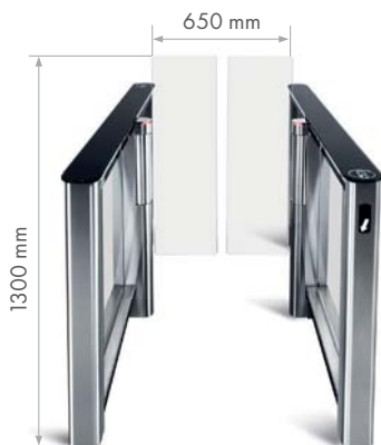
ST-01 Speed Gate with swing panels ATG-300H