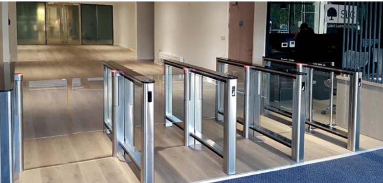
Speed gates ST-01, Office of Student Loans Company, Scotland