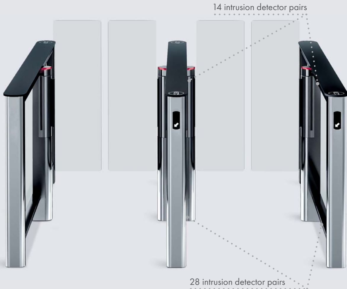
Speed gate ST-01 with central section STD-01

For indoor use Stainless steel, tempered glass