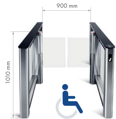
ST-01 Speed Gate with swing panels ATG-425