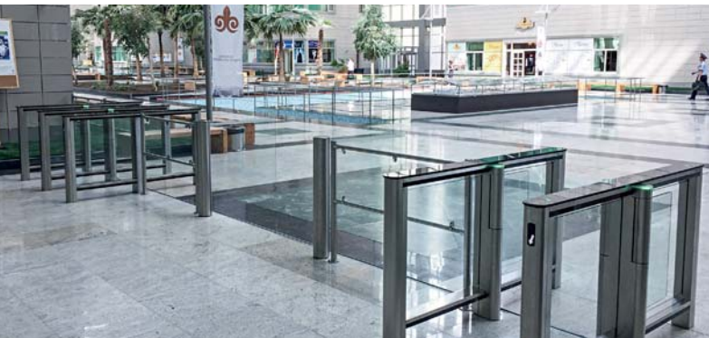
Speed gates ST-01, Nazarbayev University, Republic of Kazakhstan