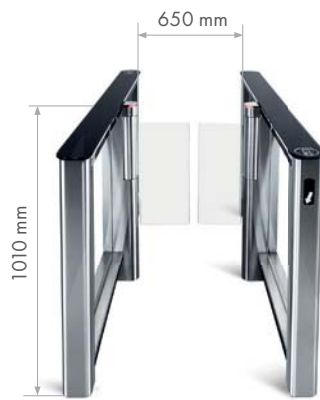
ST-01 Speed Gate with swing panels ATG-300