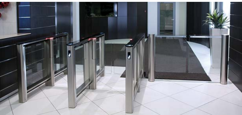
Speed gates ST-01, Business-center Energo, Russia