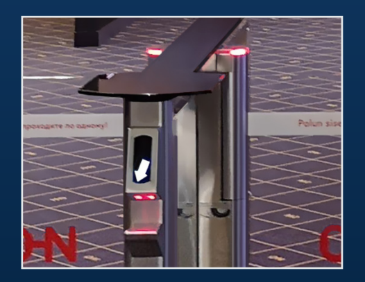
To make it more comfortable for the visitors speed gates were fitted with with a special extended glass cover for food and beverages.