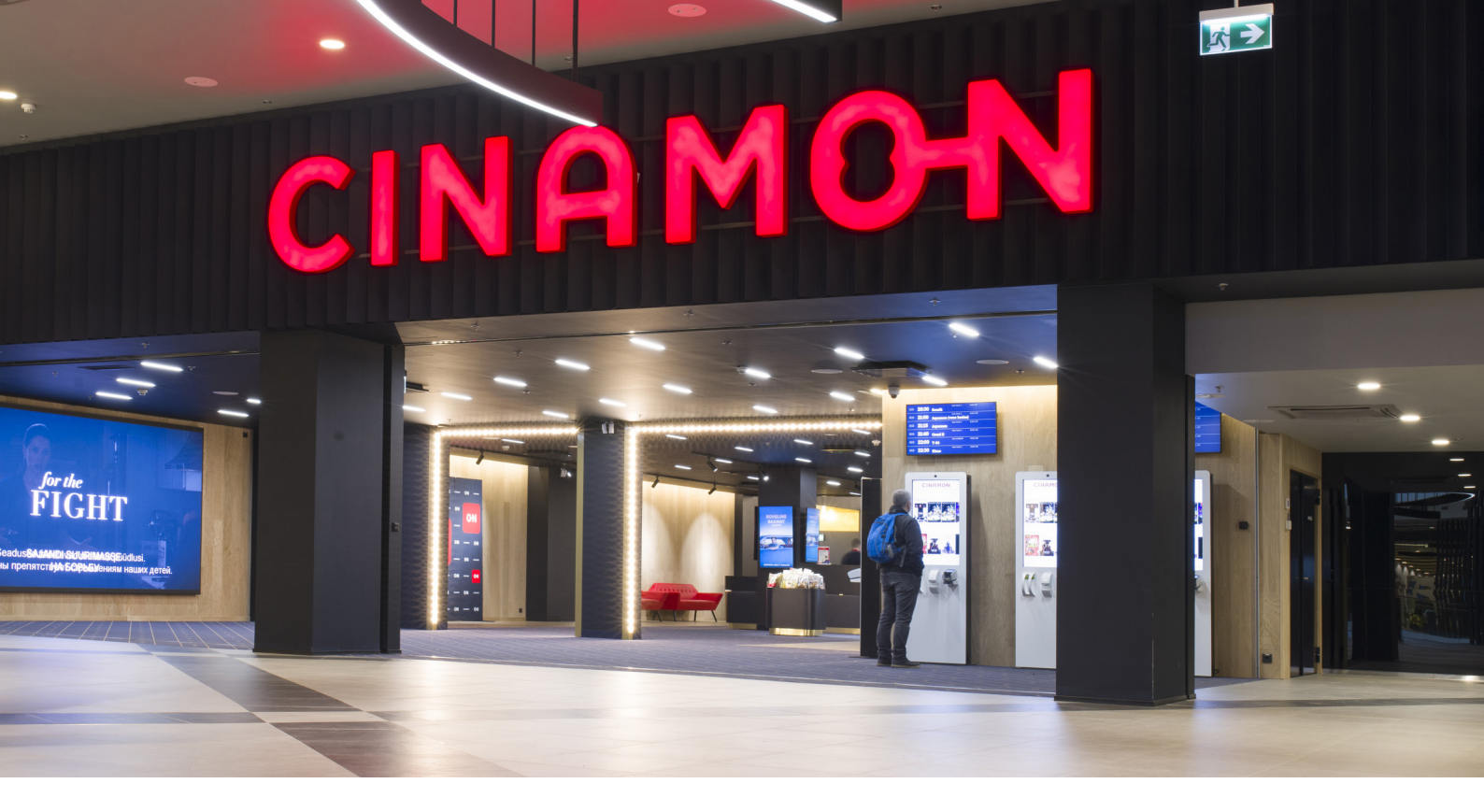
Project: Cinamon cinema chain