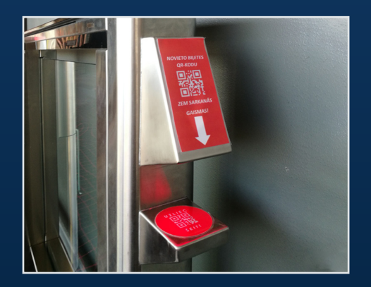
Turnstiles were equipped with barcode scanners: access to the cinema is allowed only by presenting a valid ticket.

Ghost Intelligence has installed ST-O1 speed gates and has customized them according to the requirements of cinemas.